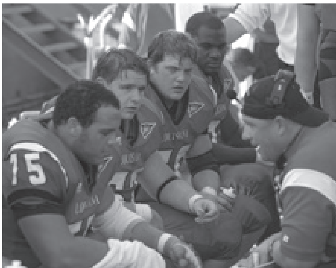
Hudson tutored an offensive line in 2005 that helped set a school record 2,797 rushing yards and 34 rushing touchdowns.