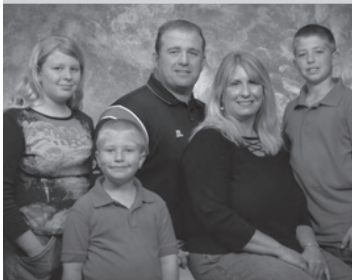
THE HUDSON FAMILY