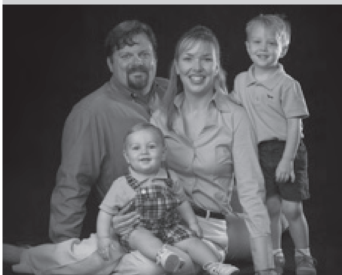
THE WINGERTER FAMILY