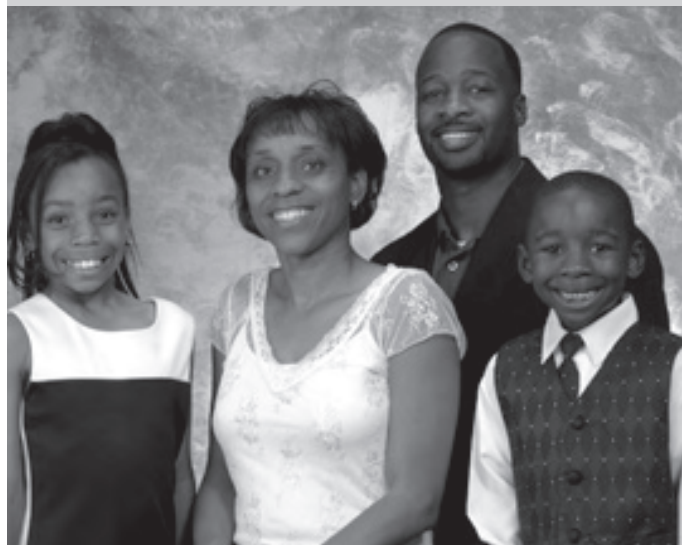
THE JENKINS FAMILY