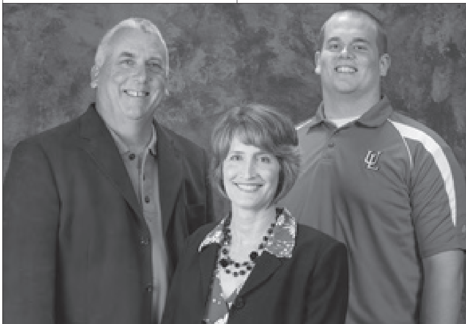
THE BUSTLE FAMILY