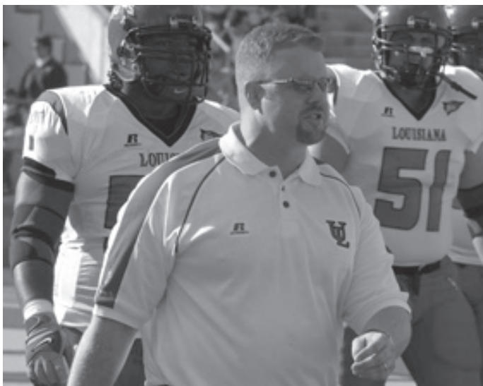
The Cajuns set the school single-game record with nine sacks at Middle Tennessee in 2005.