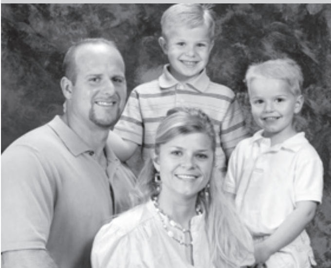
THE PHILLIPS FAMILY