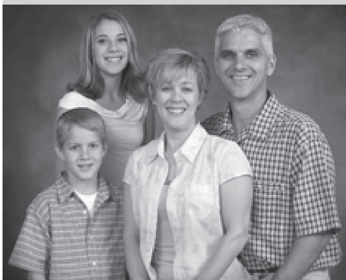
THE REBOWE FAMILY