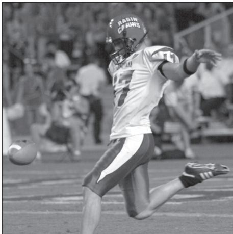
BRIT FRAMEL (2005-06)

Grant Autrey surpassed former UL punter Roy Pendergraft as the school's all-time leader in punts and punting yards.