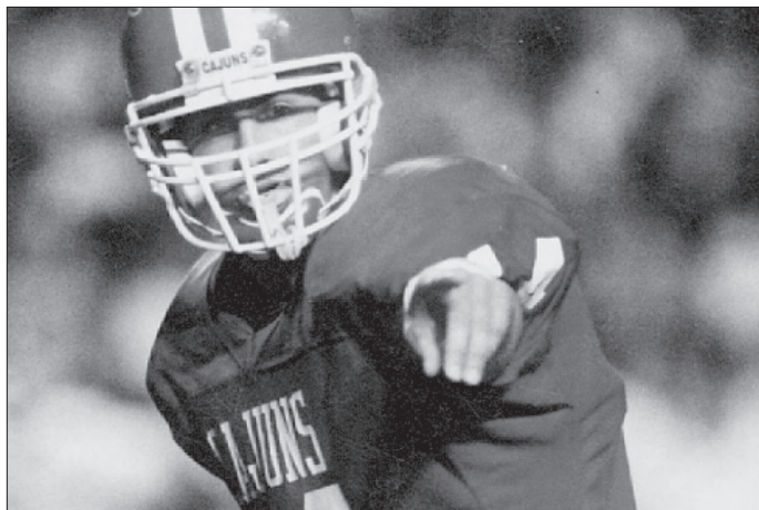
BRANDON STOKLEY (1995-98)

Brandon Stokley posted a school-record 19 100-yard games during his career.